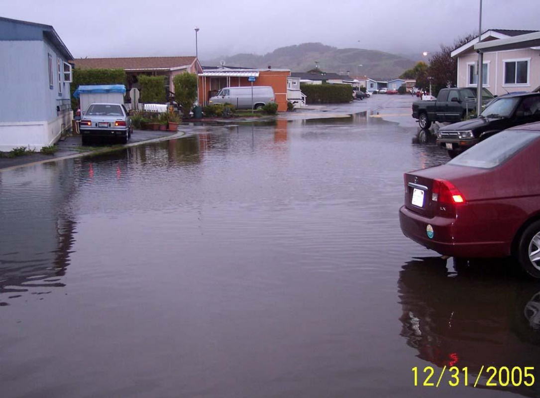
Several blocks of the Pillar Ridge community were flooded.