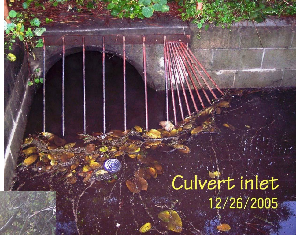
Culvert inlet 12/26/2005

In December 2005, a Big Wave contractor, clearing vegetation from this long-overgrown access road with bobcat or similar equipment packed mud and vegetation into the marsh, totally blocking the culvert outfall.