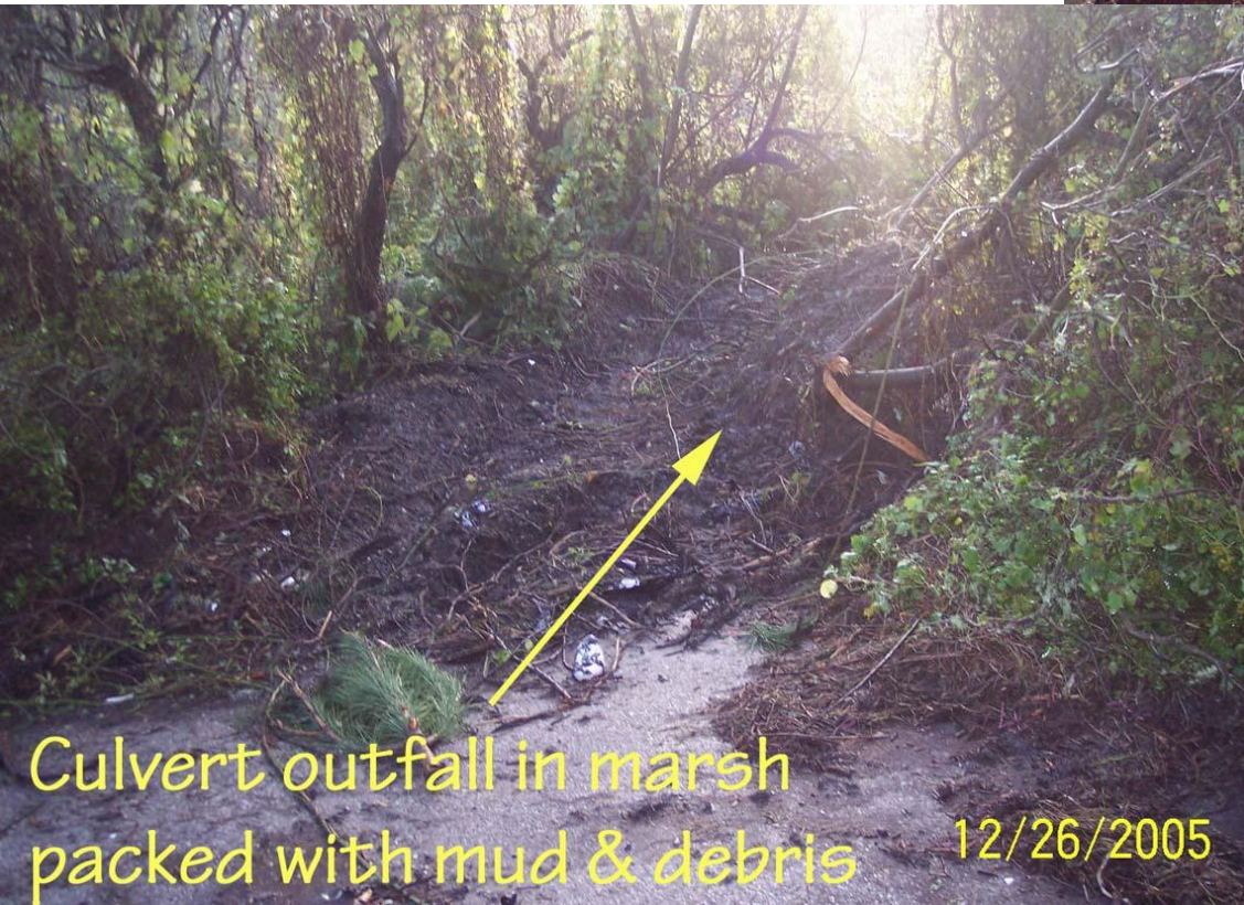
Culvert outfall in marsh packed with mud & debris 12/26/2005